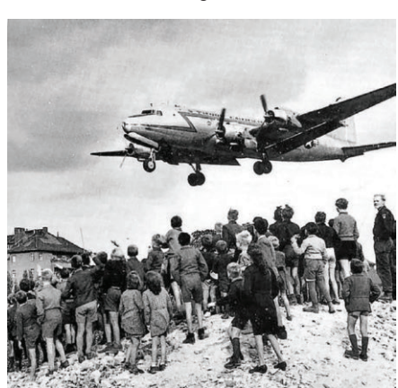
Grateful Americans Anxiously Awaiting Generous Germans.

Turns out those heroic Air Force cargo planes were loading infant formula from Germany and Ireland. For delivery to Indianapolis, Indiana, U.S.A. It was American bureaucrats who shut down factories, ignored scientific evidence, sparked panic buying, and moved with the charming speed of an exhausted three-toed sloth. A drunk, debauched, exhausted three-toed sloth. With the shakes. Dismissed the warnings from months ago. Pooh-poohed the damage and suffering. Gosh darn those unelected, unfeeling nabobs!